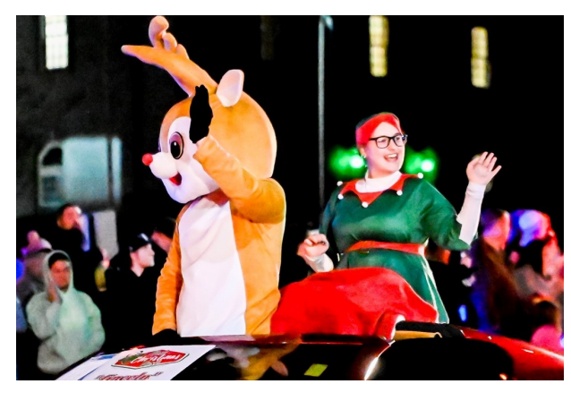
Look who made their parade debut; It's Lincoln the HCP Mascot and Lucy the Elf