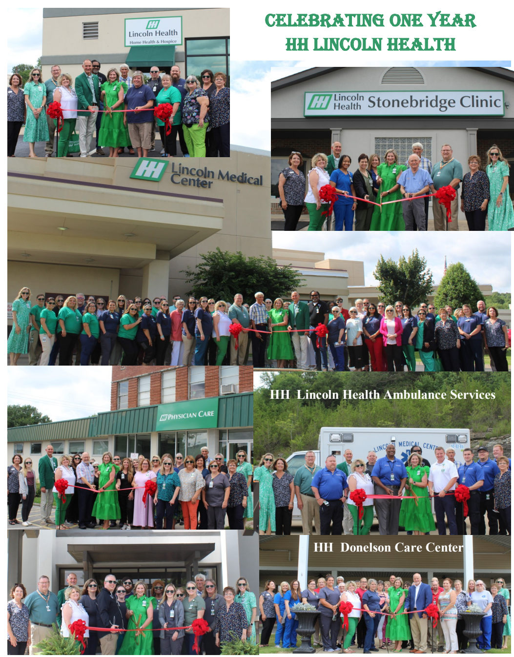
HH Patrick Rehab & Wellness

"Lincoln Health had a wonderful time celebrating our One Year Anniversary with a ribbon cutting hosted by the Chamber of Commerce. We are so proud of all that we have accomplished in our first year. We thank the community for their support. This is only the beginning of all the great things we have in store!"