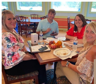
Catering Provided by Senor Lopez Mexican Grill